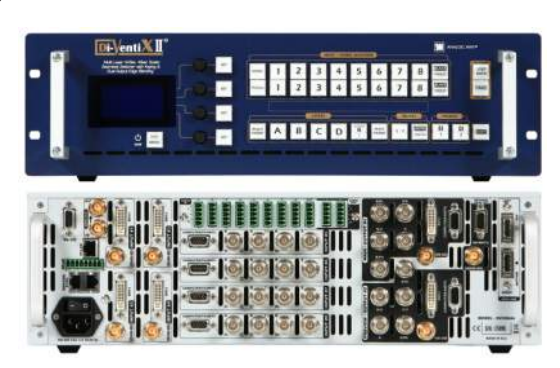
Di-VentiX II, mixer scaler and seamless switcher by Analog Way

The Di-VentiX was used in the scan room backstage to provide one single output to the Di-VentiX II with all inputs catered for DVI-A, DVI-D, XGA, component and composite video all at a variety of resolutions. The product allowed us to work seamlessly with which ever format was requested on site by the scan equipment manufacturer. All laptops were also being fed into the Di-VentiX II .