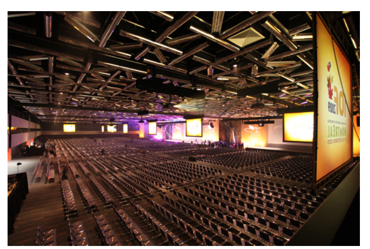
The Palais des Congrès de Montreal for the show

In 2009, the 20<sup>th</sup> World Diabetes Congress was held in Montreal, Canada, the birthplace of insulin. From October 18 to 22, over 400 speakers and 12,000 international delegates attended the event to access the latest information and opinion from the scientific community, discuss key issues in diabetes care, and exchange information on how available resources can best be used to tackle the global diabetes problem.