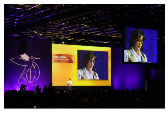
Presentation during the 20<sup>th</sup> World Diabetes Congress

We convinced our customer, who was a long time Folsom user, that we were able to meet all his requirements and specifications with Analog Way gear. The equipment turned out with the quality